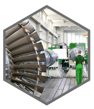
Mechanical Engineering Additive Manufacturing

Metal impregnation, Repair of blowholes, Filling filler & putty. Reduce scrap, preserve values.