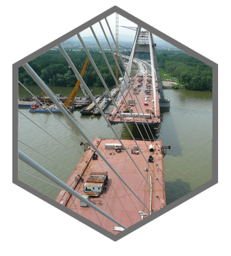
Steel & Bridge Construction

Slide bearings, slide linings, Adjustment pads, seals and infiltration of porous structures. Avoid costs, refine products.