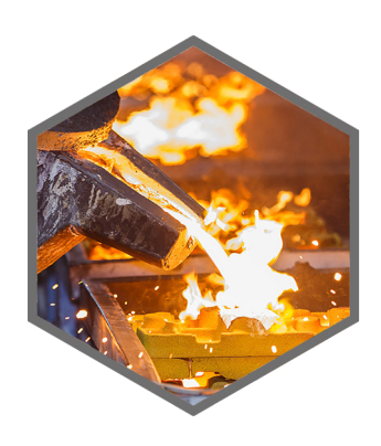
Foundry & Automotive

Metal impregnation, Repair of blowholes, Filling filler & putty. Reduce scrap, preserve values.